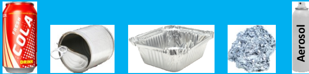
Metal Containers and Foil