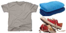
Textiles: Clothing, Shoes, Towels, etc. (any condition)