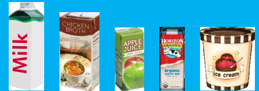
Cartons and Juice Boxes

Include caps and lids with commingled items. Please empty and rinse items.