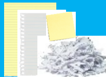
Paper (shredded OK)