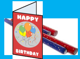
Greeting Cards and Gift Wrap