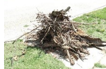
Yard Waste (or follow Town/Village rules)*