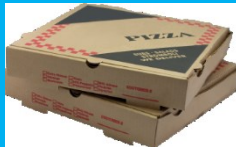
Pizza Boxes (clean only)