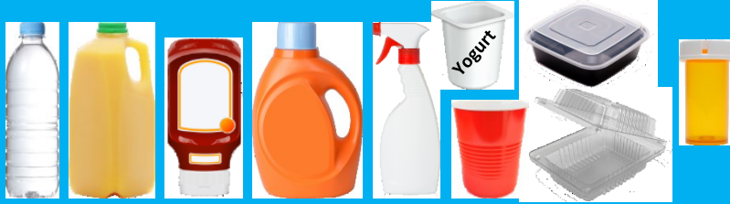
Rigid Plastic Containers - no foam, bags, nor straws