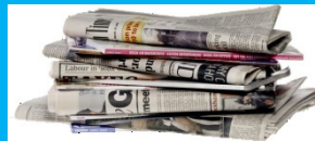
Newspapers, Magazines, Catalogs