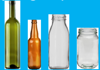
Glass Bottles and Jars* *check local rules